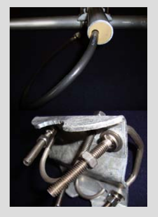
Natural rubber plugs & Heavy-duty galvanized clamp w/S.S. hardware