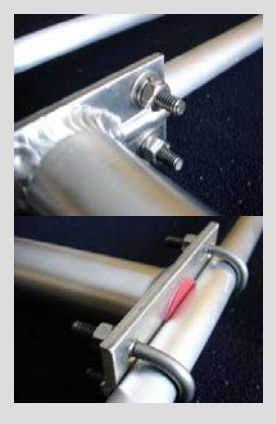
Heavy-duty dipole fixture